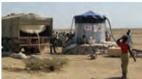
Water treatment and distribution.