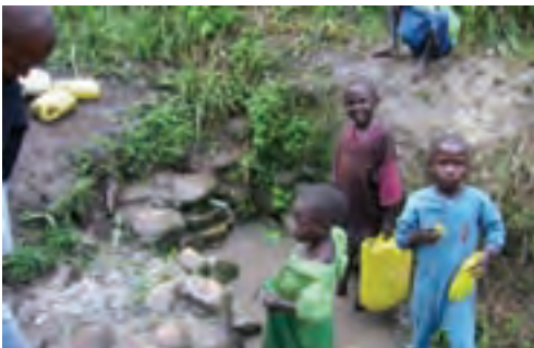
Children collecting water.