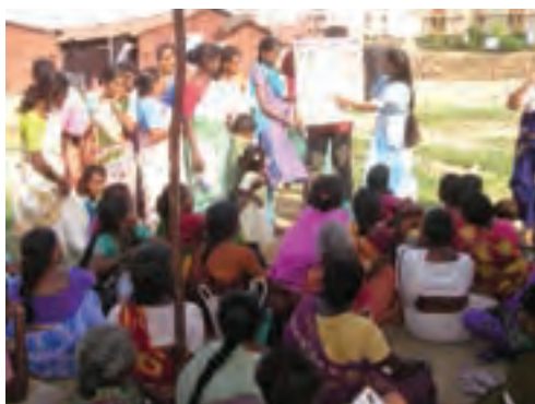
Tsunami Response.