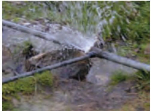
East Timor. Illegal Connections.