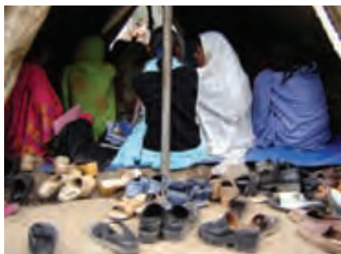
Community Meeting.