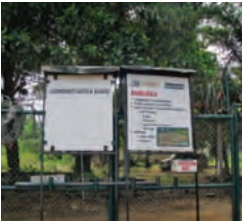
Information board in Liberia.

Communities initially used the ledgers as guest books to record visitors to the community. This made sure that other NGOs were not duplicating efforts but later the communities were trained to use the ledgers to record the movements of project materials. The Committee made sure that any request for materials from project staff details the quantities, output and staff names. This helps to ensure that materials are used for their intended purpose. (Tearfund 2009 personal communication)