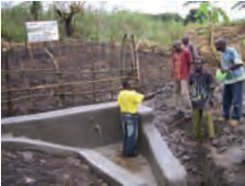
Spring Protection.

www.wsp.org/UserFiles/file/327200744509_saybetter.pdf