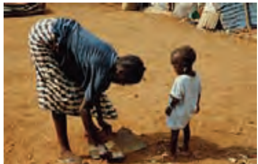
Sierra Leone, IDP camps.